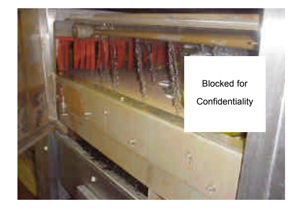
After 7 days of treatment, scale was removed.

Untreated water forms hard scale deposits on the wall of the pasteurizer. Picture shown before Oxcide treatment.