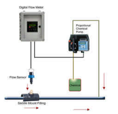
Typical injection system treats water proportional to flow in the main water line.

Facility treatment over 60 days resulted in regular progression of descaling, and increasing ORP values throughout the facility. Descaling was apparent in all areas that resulted in direct cost reduction, chemical usage, maintenance labor, and improved efficiency and food safety.