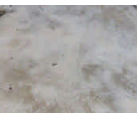
Before treatment, scale deposits formed on the floors and surrounding area.