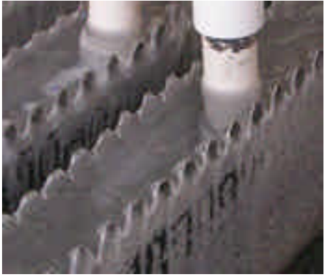
Initial hard deposits on plate ice machine forms within a few days, has to be cleaned with acid.