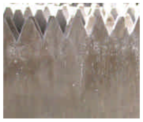
60 days after treatment, scale was entirely removed and no new scale was formed.