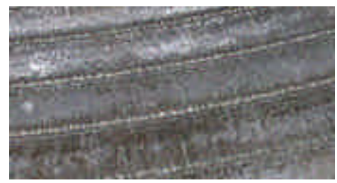
30 days after treatment, scale was partially removed with normal use.