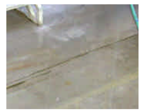
After 60 days of treatment, the area floors were clean and slight remaining scale was soft and powdery.