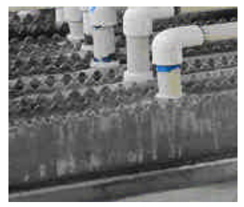
30 days after treatment, scale was partially removed and dissolved away with normal use.